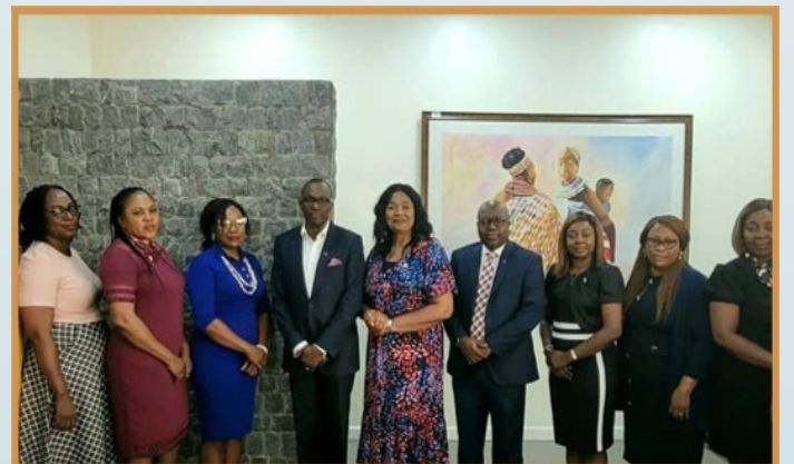
VISIT TO CUSTODIAN