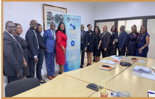
VISIT TO SOVERIGN TRUST