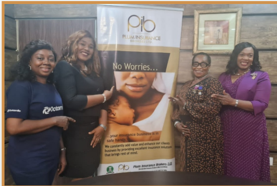
PILA VISIT TO PLUM INSURANCE BROKER

The past 73 days of inauguration of the newly elected executives into office to the glory of God has been upbeat and quite eventful. The executives kickstart visit to various underwriting firms with the sole aim of lifting the face of PILA for greater support and collaboration.