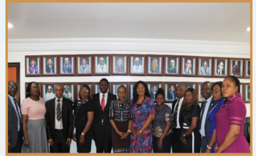
VISIT TO CIIN