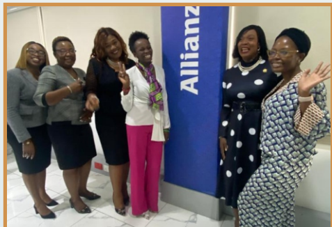
PILA VISIT TO ALLIANZ