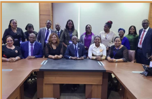
PILA VISIT TO LASACO ASSURANCE