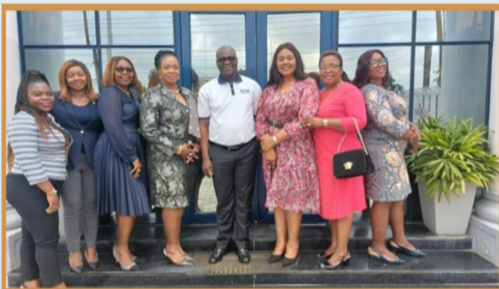
VISIT TO NOOR TAKAFUL