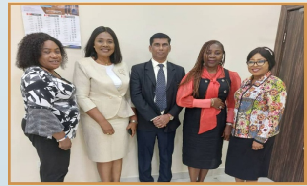
VISIT TO PRESTIGE