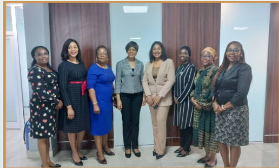
VISIT TO KBL