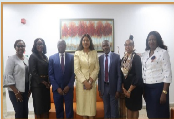
VISIT TO NSIA