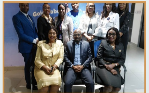
VISIT TO AIICO