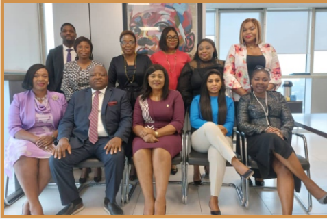
Visit to Zenith General