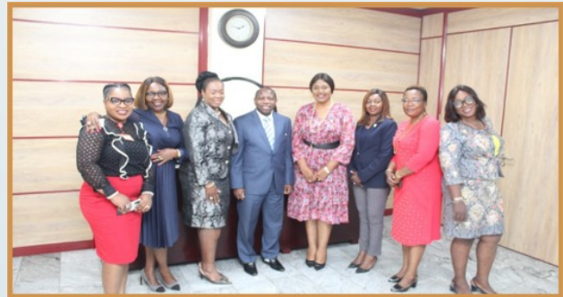
VISIT TO NEM