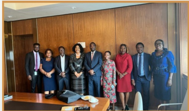
PILA VISIT TO CORONATION